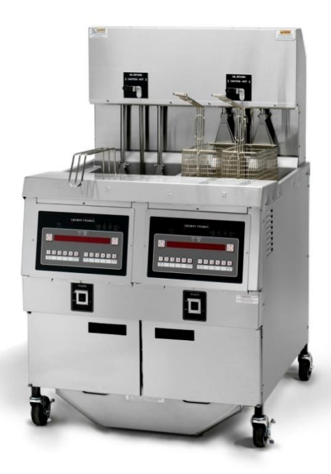
OEA 322 2-well electric auto lift open fryer

Henny Penny open fryers offer high-volume, integral multi-well frying with programmable operation, oil management functions and fast, easy filtration.