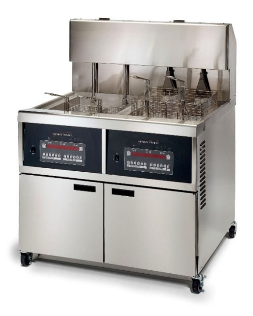
OGA 342 2-well large capacity auto lift gas open fryer

Henny Penny open fryers offer high-volume frying with programmable operation, oil management functions and fast, easy filtration.