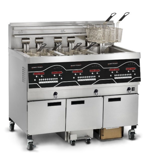
EEE 143 3-well open fryer