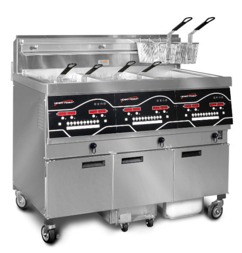
EEG 243 3-well gas open fryer