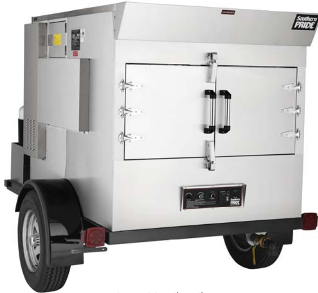
SPK-500 rail trailer

Available for smoker models: MLR-150, SPX-300, SPK-500, and SP-700