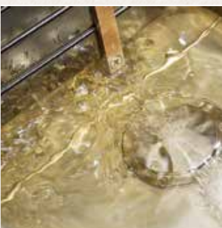
25% LESS OIL