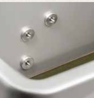
AUTOMATIC OIL TOP-OFF